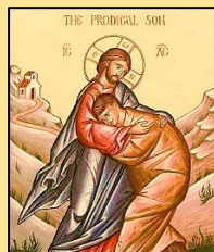
Sunday of the Prodigal Son