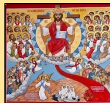
Sunday of the Last Judgment