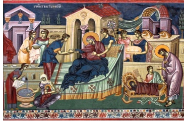
Nativity of the Theotokos