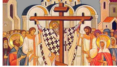
Elevation of the Cross

Pastoral reflection: The beginning of the Church Year (Sept 1) as a great time to work on repentance: