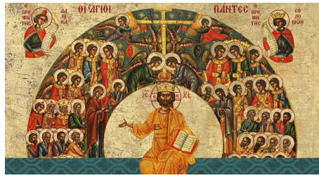
Sunday of All Saints