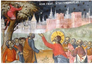
Sunday of Zacchaeus