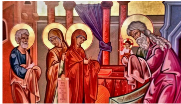
Meeting of the Lord in the Temple

Location of Services: Holy Theophany Church, N2107 State Road 67, Walworth, WI 53184