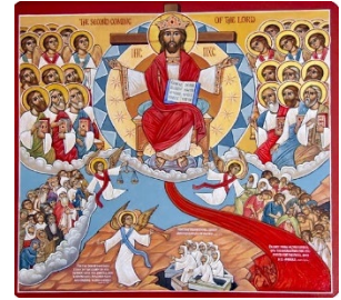
Last Judgment/Second Coming