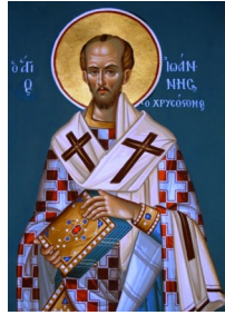
St John Chrysostom (11/13)