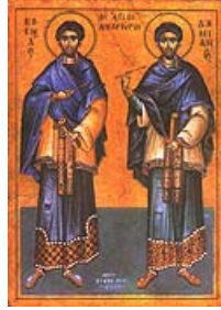
Holy Unmercenary Cosmas and Damian (11/1)