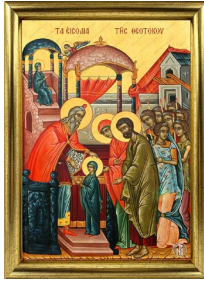
Entrance of Theotokos in the Temple (11/21)

Location of Services: Holy Theophany Church, N2107 State Road 67, Walworth, WI 53184