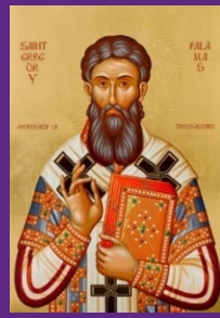
St Gregory Palamas