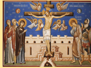
Sunday of the Veneration of the Cross

Schedule of Services for March 2025. Hours for Sunday Liturgy start at 9:40 AM. All Services Streamed Except for Readers Vespers unless otherwise noted Divine Liturgy on Sunday of St Basil the Great)