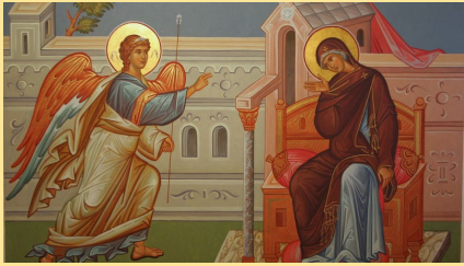
Annunciation of the Theotokos