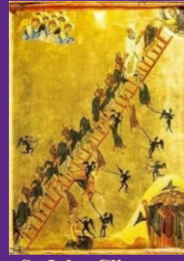
St John Climacus