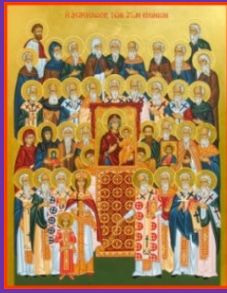
Sunday of Orthodoxy