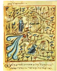
Sunday of Forgiveness