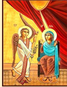
Annunciation of the Theotokos