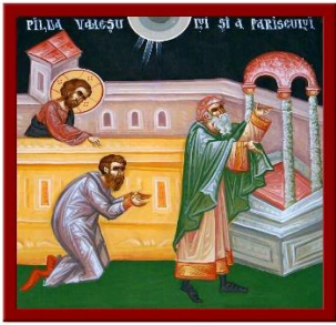
Sunday of the Publican and the Pharisee