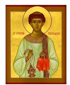
Protomartyr & Archdeacon Stephen