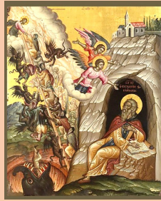
Ladder of St John Climacus