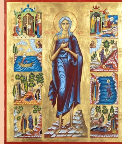
St. Mary of Egypt