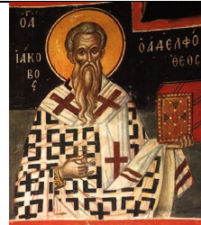
James, Brother of the Lord October 23