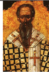
Dionysius the Areopagite October 3