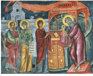
Presentation of Christ in Temple