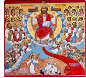
Last Judgment/Second Coming