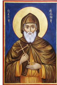
St. Anthony the Great