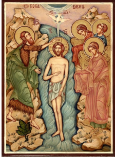
Theophany of Christ