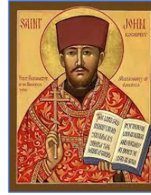
Hieromartyr Archpriest John Kochurov