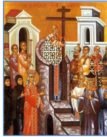
The Elevation of the Cross