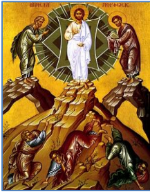
The Transfiguration of our Lord

Welcome to Holy Theophany Orthodox Church. We invite you to join us in prayer and worship, so that we can share the mission of proclaiming the saving message of Jesus Christ.