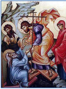
Descent Into Hades

Welcome to Holy Theophany Orthodox Church. We invite you to join us in prayer and worship, so that we can share the mission of proclaiming the saving message of Jesus Christ.