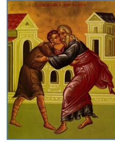
The Prodigal Son

✠ Location of Services: Holy Theophany Church, N2107 State Road 67, Walworth, WI 53184 ✠