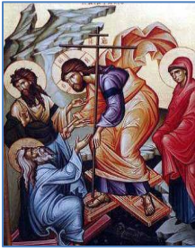
Descent Into Hades

Welcome to Holy Theophany Orthodox Church. We invite you to join us in prayer and worship, so that we can share the mission of proclaiming the saving message of Jesus Christ.