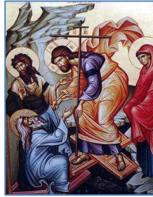
Descent Into Hades