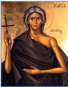
St. Mary of Egypt

Welcome to Holy Theophany Orthodox Chapel. We invite you to join us in prayer and worship, so that we can share the mission of proclaiming the saving message of Jesus Christ.