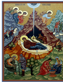
The Nativity of our Lord God and Savior Jesus Christ