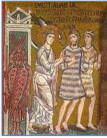
The Expulsion of Adam from Paradise

Welcome to Holy Theophany Orthodox Chapel. We invite you to join us in prayer and worship, so that we can share the mission of proclaiming the saving message of Jesus Christ.