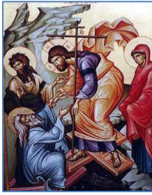
Descent Into Hades

Welcome to Holy Theophany Orthodox Chapel. We invite you to join us in prayer and worship, so that we can share the mission of proclaiming the saving message of Jesus Christ.