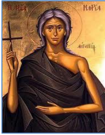
St. Mary of Egypt

Welcome to Holy Theophany Orthodox Chapel. We invite you to join us in prayer and worship, so that we can share the mission of proclaiming the saving message of Jesus Christ.