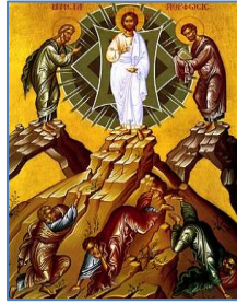
The Transfiguration of our Lord