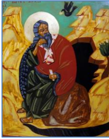
The Prophet Elijah

Welcome to Holy Theophany Orthodox Chapel. We invite you to join us in prayer and worship, so that we can share the mission of proclaiming the saving message of Jesus Christ.