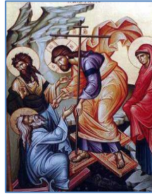
Descent Into Hades