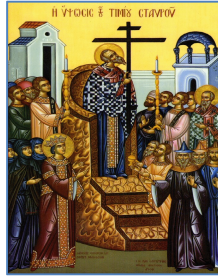
The Elevation of the Cross