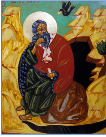
The Prophet Elijah

Welcome to Holy Theophany Orthodox Chapel. We invite you to join us in prayer and worship, so that we can share the mission of proclaiming the saving message of Jesus Christ.