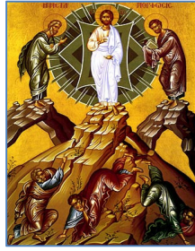
The Transfiguration of our Lord