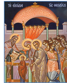
Entry of the Theotokos into the Temple